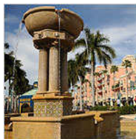
Relaxations for Turtles and Humans Alike