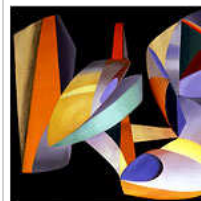
History Lesson in Geometric Abstraction