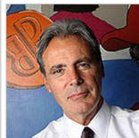
Judge Keeps His Word to Immigrant Who Kept His