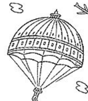
Letters: A Senator and 'a Dysfunctional System'