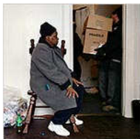
A Sight All Too Familiar in Poor Neighborhoods